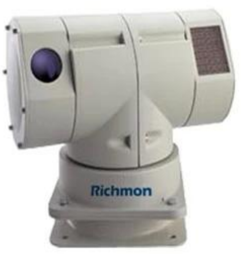
Polis Araba için PTZ Kamera