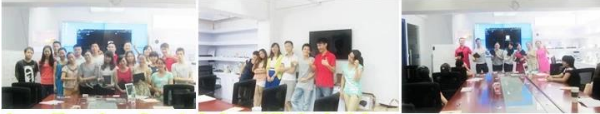
Inner Training after study from Alibaba in July