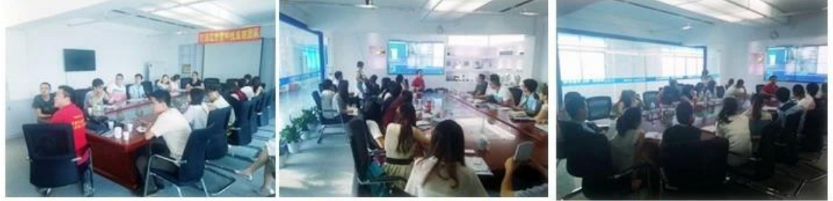
Technical Training For Fast Response to Customer Richmor 锐驰曼