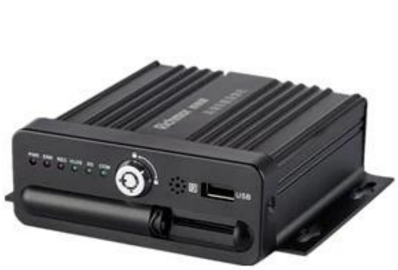
Ekonomik SD Kart MDVR