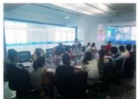
Technical Training For Fast Response to Customer Richmor 锐驰