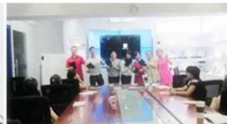
Inner Training after study from Alibaba in July