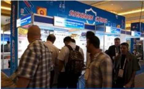
ISC 2018 ISC WEST Expo Las Vegas