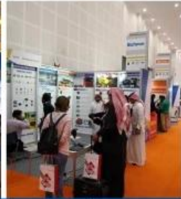
INTERSEC 2018 INTERSEC Dubai Expo