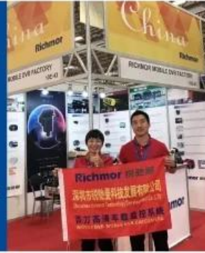
ISAF 2017 ▶ Istanbul Expo Center (ifm) Turkey