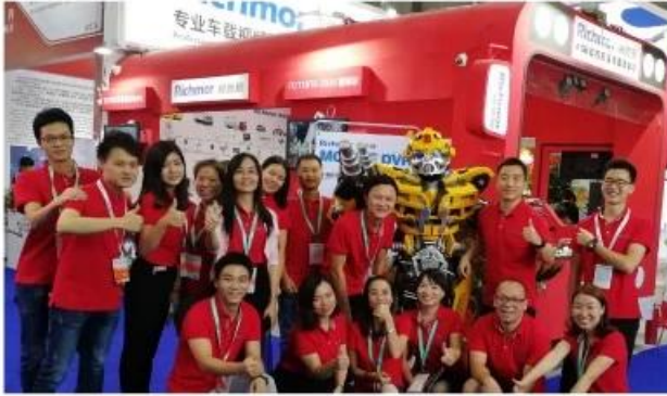
◀ ITS 2017 Shenzhen Convention & Exhibition Center