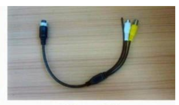
AV Output Cable