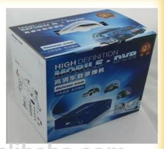
Brand Packing & Blister Packing