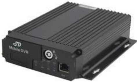
SD Mobile DVR with 3G GPS