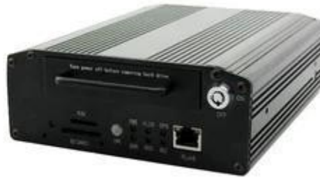
HD Mobile DVR with 3G GPS