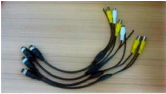
AV Input Cables