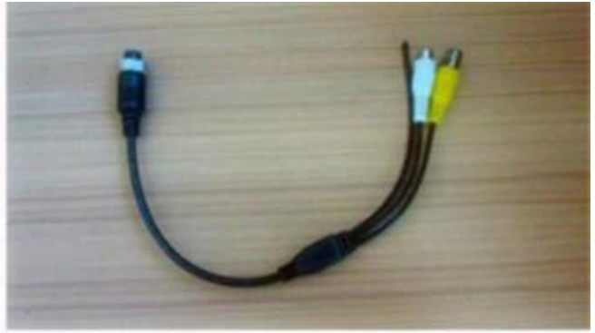
AV Output Cable