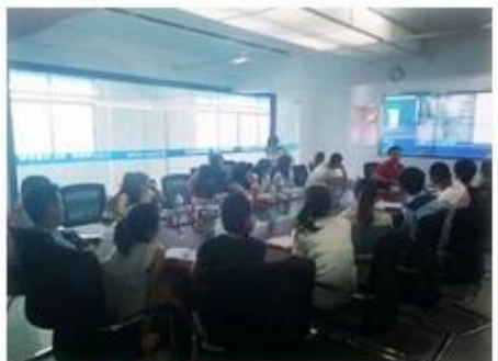
Technical Training For Fast Response to Customer Richmor 锐驰曼