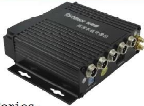
210 Series- AHD 4CH (Top Sale)