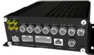
9108 Series- 8ch NVR /9204 Series- 4ch NVR